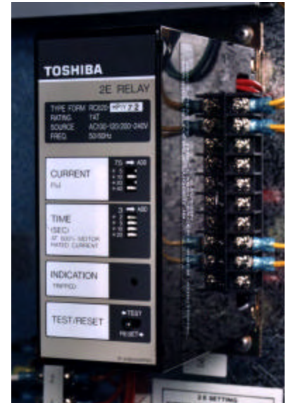
RC820 (2E) Motor Protection Relay