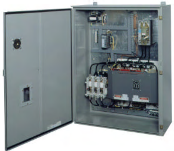
TD111 Solid State Starter

* - These units use air contactors for the bypass contactor. Consult Factory for higher rated units.