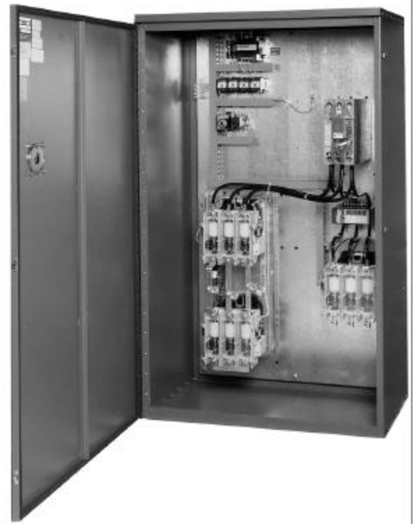
Size 4V Wye-Delta Open Transition Starter

Notes: 4V -- Size 4 Vacuum Contactor 5V -- Size 5 Vacuum Contactor 6V -- Size 6 Vacuum Contactor 7V -- Size 7 Vacuum Contactor