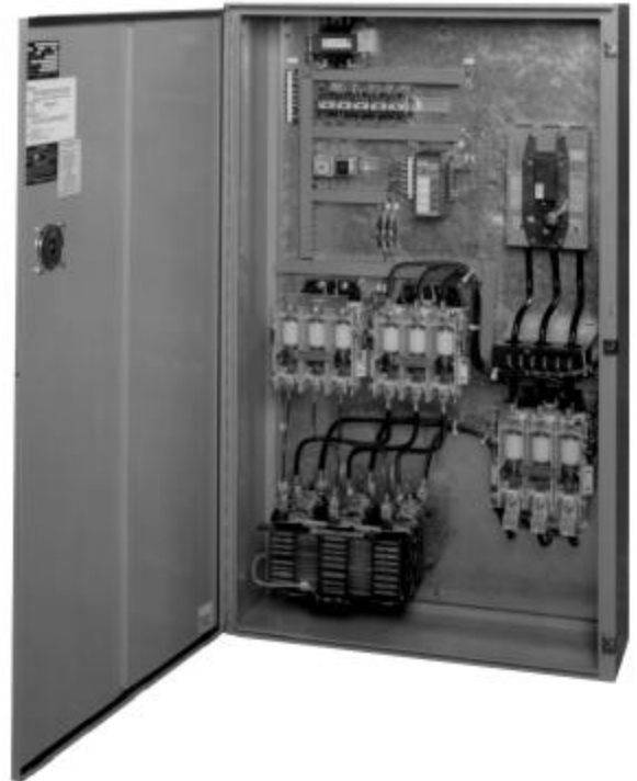
Size 5V RVAT Starter

RVAT starters provide the highest starting torque per line ampere and are closed transition. They are used to reduce the starting power requirements when reduced starting torque is allowable. An incomplete sequence timer is standard to provide maximum protection against extended starting times. These starters include a medium duty autotransformer with voltage taps of 50%, 65%, and 80%.