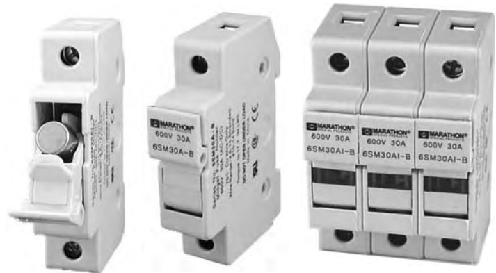
6SM30A1-B shown with fuse (fuse not included)