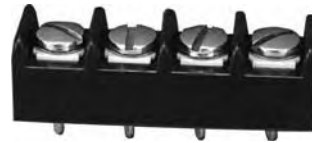
2599A GP 04 PSB