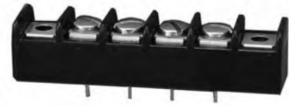
2591A GP 04 PSB