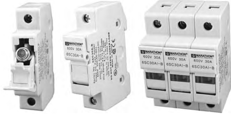
6SC30A1-B shown with fuse (fuse not included)