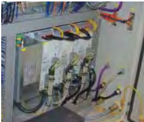
Lenze control cabinet for main drive