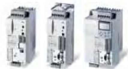
Lenze compact servo