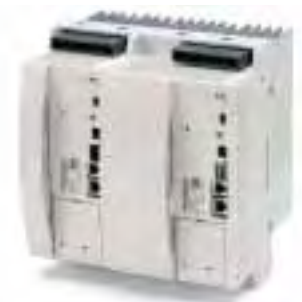
Axis controller for robot controls

Lenze's new motor is so compact that it can be used on the wrist joint of a six-axis robot. It can reach a permanent welding force of 7 kN. The maximum force is 15 kN.