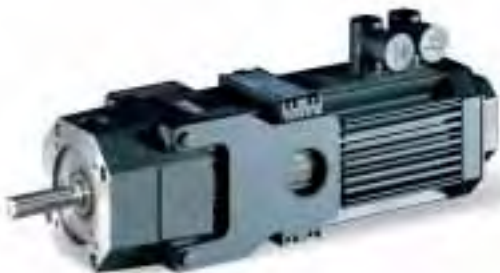
Servo spindle motor