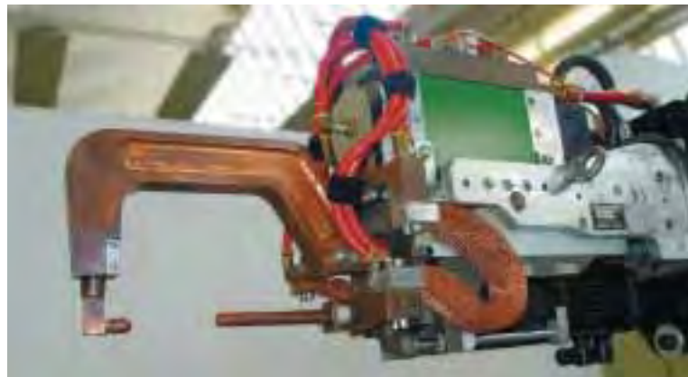
Welding gun with integrated spindle motor