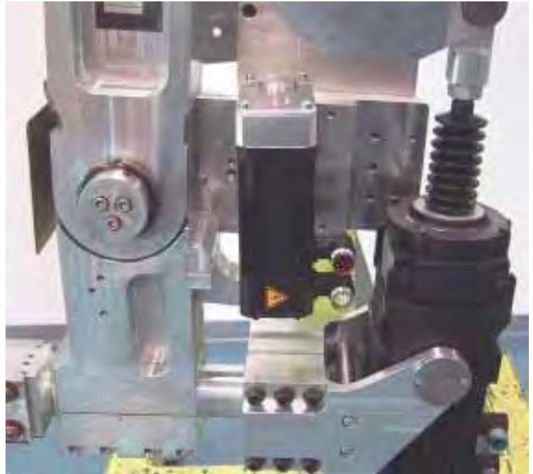
Servo welding gun

The enhanced technology prevents the copper caps from bouncing on the contacted material. This increases the service life of the tools. Depending on the cycle time, productivity can be increased by up to 25%. The use of electrical drives now also allows easier changes between products thanks to easier and more flexible adaption.