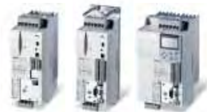
Lenze compact servo