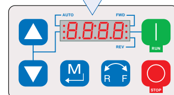
NEMA1 (Up to 10HP) Keypad