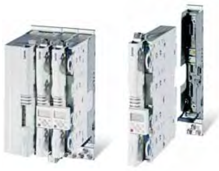
L-force 9400 StateLine Servo Drives

These drives comply with: Configurable technology applications DS402 / IEC 61800-7-2