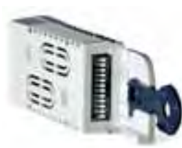
MM110 memory module

All equipment settings and application data are stored in a pluggable memory module. This means that, in the event of the hardware being replaced, for instance, it is only necessary to plug the memory module into the new device with a single click and the drive can be used again immediately.