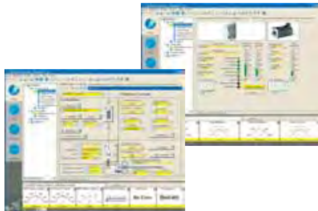
User interfaces in L-force Engineer