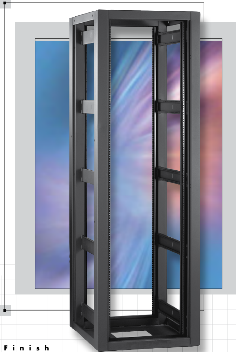
Finish Black Texture

The rack frame can also be incorporated into complete cabinet rack assemblies. These cabinet rack assemblies would consist of any combination of the frame with any or all of the optional accessories.