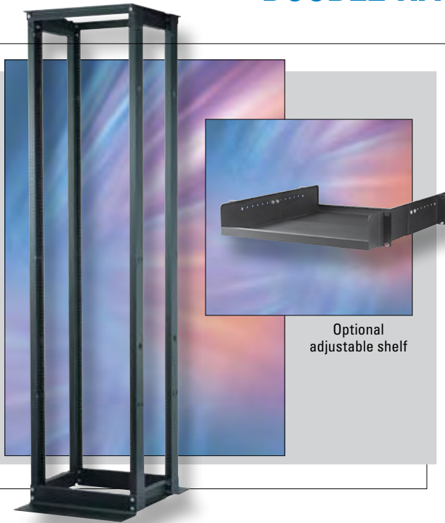
Optional adjustable shelf

Bud's Double Racks offer the ideal solution when full, natural ventilation and a strong four-point mounting system is required, but without the need for the security offered by a full cabinet rack. Offered in the standard 84" height and in three commonly used depths.