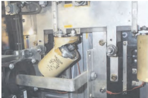
Photo 6, Capacitor Failure

4. What about spare VFDs? Store them in a clean, dry environment, with no condensation allowed. Place this unit in your PM system so you know to power it up every 6 months to keep the DC bus capacitors at their peak performance capability. Otherwise, their charging ability will significantly diminish. A capacitor is much like a battery-it needs to go into service soon after purchase or suffer a loss of usable life.