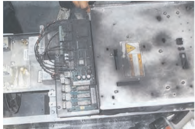
Photo 1, Fan Injecting Dust into Drive Enclosure

Most VFDs fall into the NEMA 1 category (side vents for cooling airflow) or NEMA 12 category (sealed, dust-tight enclosure). Drives that fall in the NEMA 1 category are susceptible to dust contamination. Dust on VFD hardware can cause a lack of airflow, resulting in diminished performance from heat sinks and circulating fans (Photo 1).