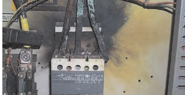
Photo 3, Arcing Caused by Loose Input Contacts

Loose control wiring connections can cause erratic operation. For example, a loose START/STOP signal wire can cause uncontrollable VFD stops. A loose speed reference wire can cause the drive speed to fluctuate, resulting in scrap, machine damage, or personnel injury.